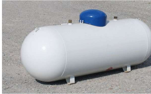
► Empty Storage Tanks