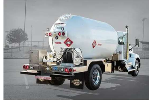
► Bobtail Truck