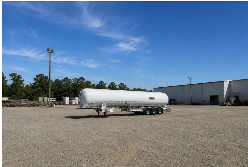
► 30,000-gallon storage tank