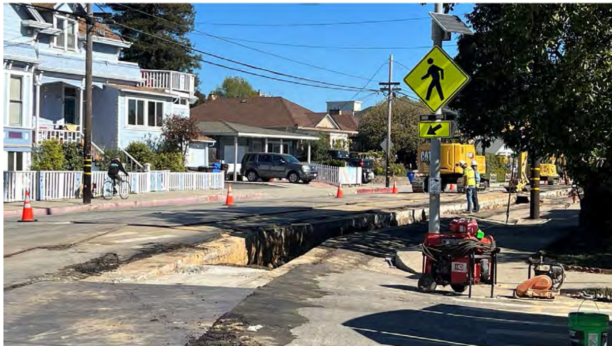
Workers install a water pipe on Broadway from Riverside Avenue to Clay Street in Santa Cruz in February as part of the Pure Water Soquel Conveyance Project.

plant, and crews have been installing pipes under city and county roads for months. Soquel Creek Water District will operate the injection wells.