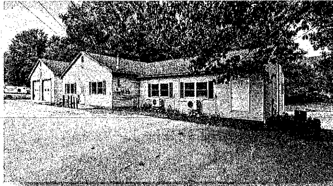
(446 NH Route 25)

Tonight, we will gather community input on whether the Town should proceed with the steps required to hold a Special Town Meeting to fund this potential purchase.