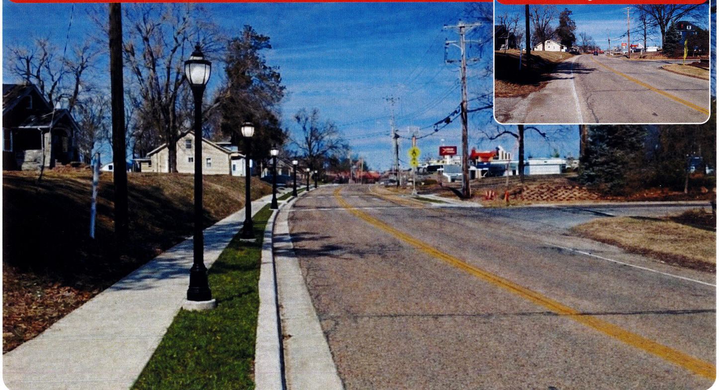
Photo of existing conditions.